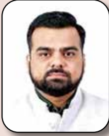
Programme Deputy Director