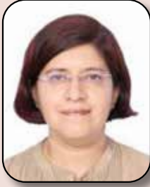
Programme Batch Co-ordinator