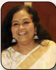
Programme Batch Director