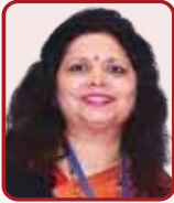
Prof. Mona Khare

30 September - 10 October, 2024 (Online) 14.00 to 17.15 hrs