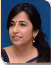
Programme Batch Co-ordinator