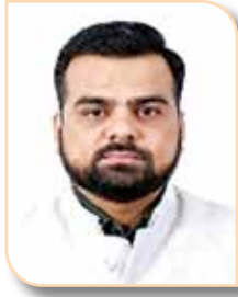
Programme Deputy Director